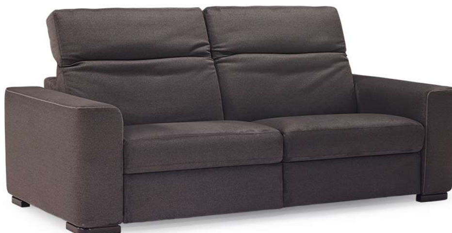
■ Vers. 446