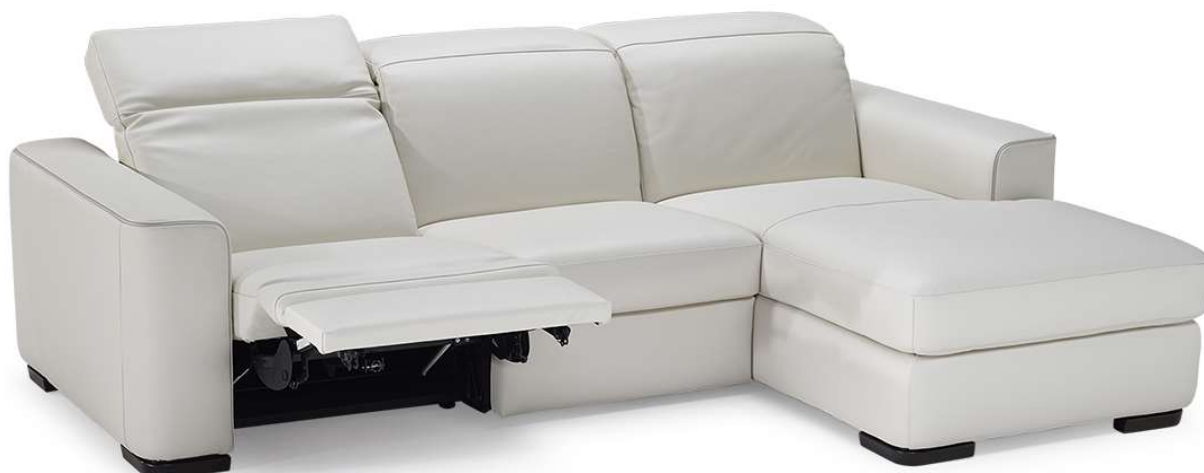
■ Vers. 182+049