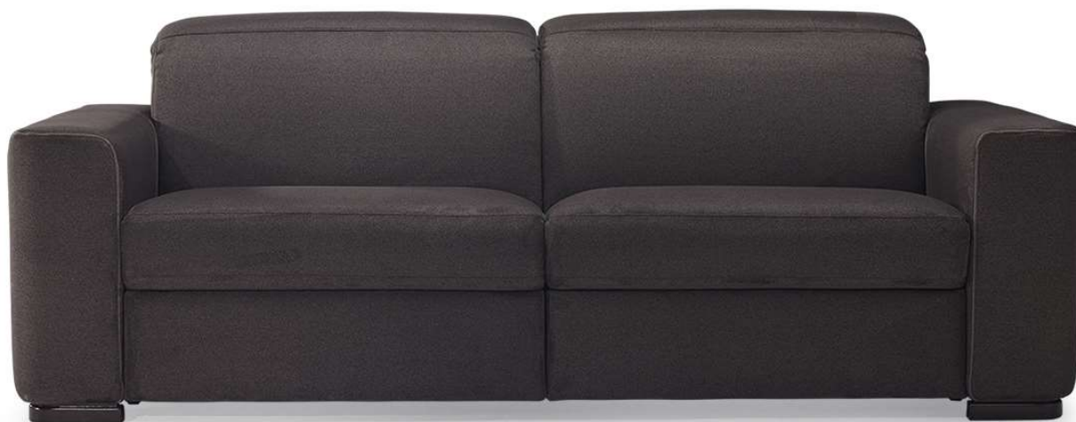
■ Vers. 446